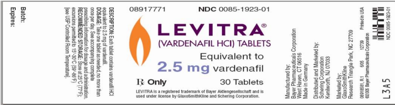
Figure 2-A1 Drug label for Levitra

19) Read the label in Figure 2-A1 and find the following information: