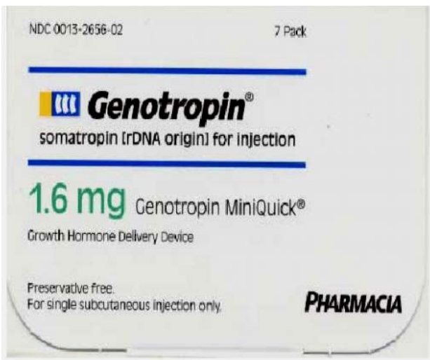
Figure 2-A4 Drug label for Genotropin

15) Read the label in Figure 2-A4 and find the following information: