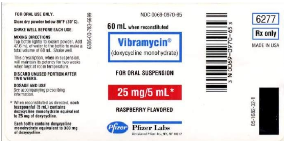
Figure 2-A2 Drug label for Vibramycin

20) Read the label in Figure 2-A2 and find the following information: